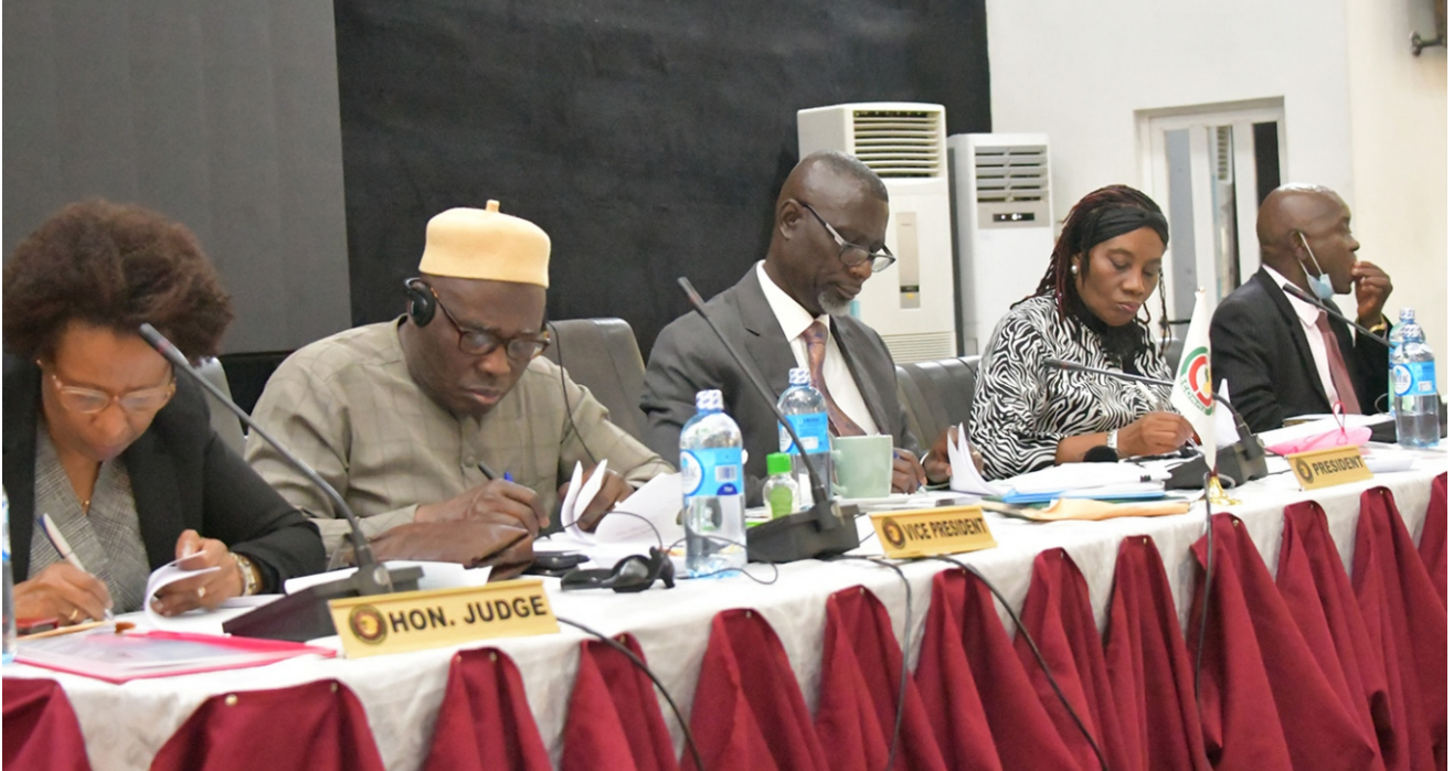
Honourable Judges of the Court taking notes during a presentation

A weeklong retreat for judges and staff of the Court to evaluate its Electronic Case Management System (ECMS) has been held at Global village near Abuja. The ECMS was introduced in 2020 following the outbreak of the Covid-19 to enable the e-filing of cases and the virtual hearing of cases.