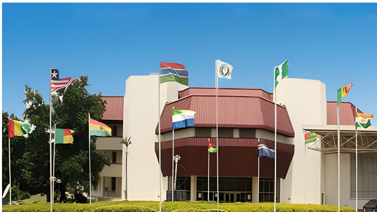
Venue of the Programme

There were also goodwill messages from Honorable Chief Fortune Charumbira, the president of the Pan-African Parliament, Honorable Mrs. Nabeela Tunis, the Sierra Leonean Minister of Foreign Affairs and International Cooperation, Mr. Ennaam Mayara, President of the Moroccan House of Councilors and Members of the Diplomatic Corps.