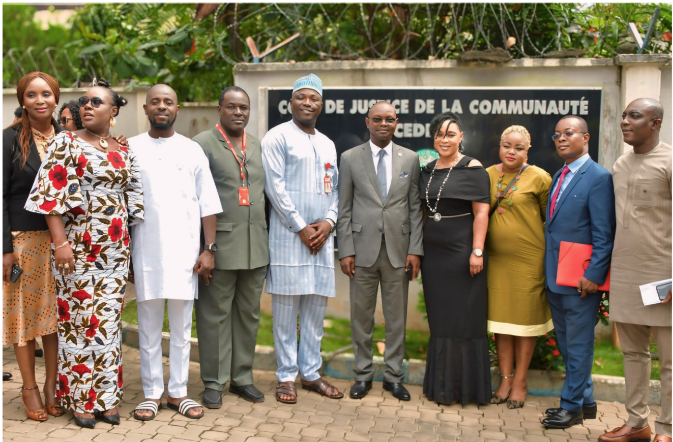
The new Chief Registrar (5th right) with former colleagues from the ECOWAS Commission

A delegation from the ECOWAS Commission comprising officials from the office of the Vice President, Audit, Human Resources and Communication Departments also witnessed the ceremony.