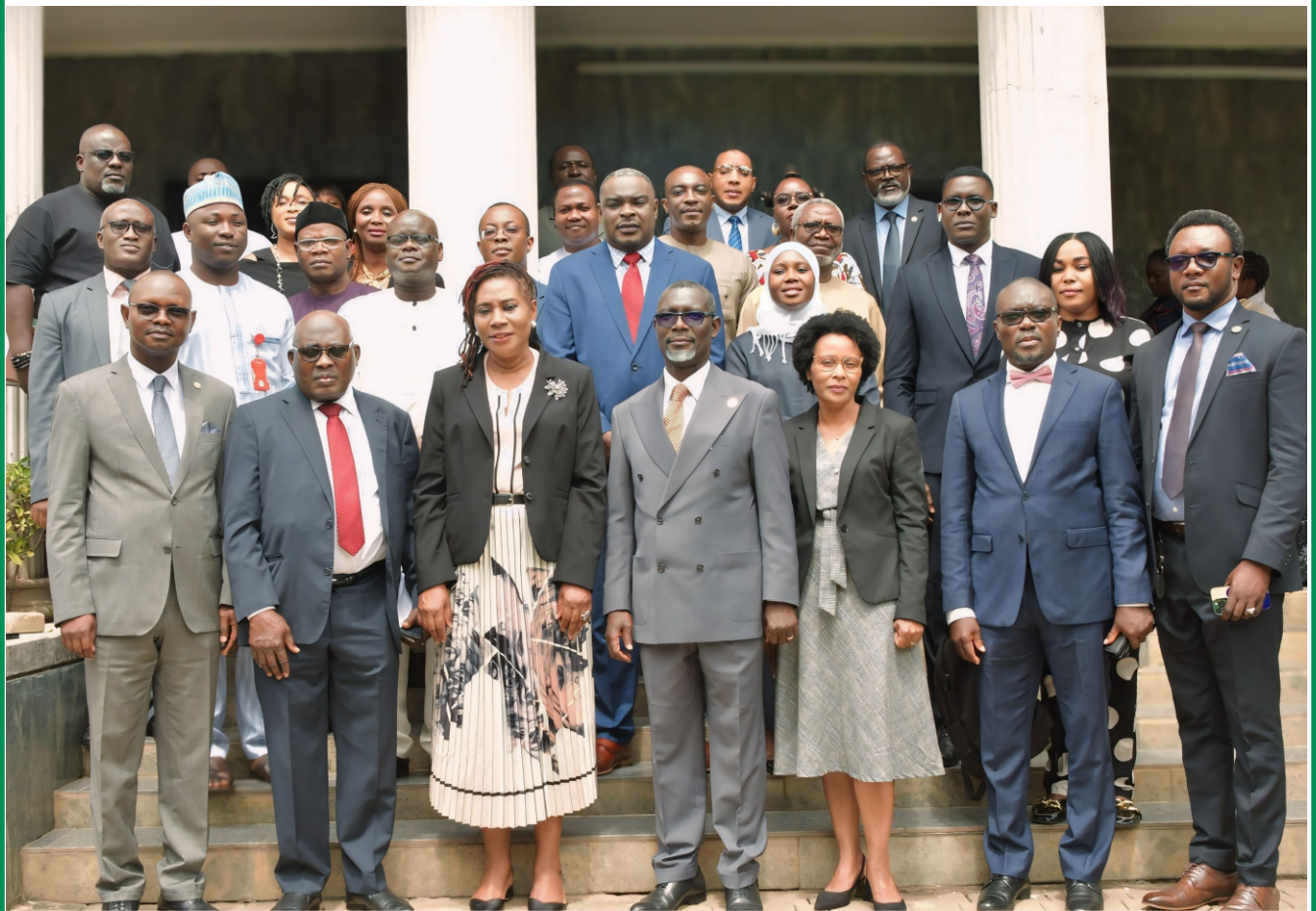
Judges of the Court with the outgoing and incoming Chief Registrars (2nd right and 1st left respectively) alongside newly recruited staff after the oath taking ceremony

The former Chief Registrar used the opportunity to present a copy of the latest law report of the Court, the 2016 edition to the President of the Court and stressed the need to expedite the clearing of the backlog of the reports in order to bring them up to date.