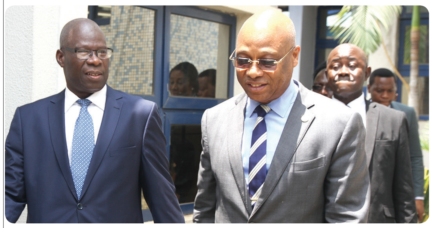
Outgoing President (left) welcoming President of ECOWAS Commission (right)