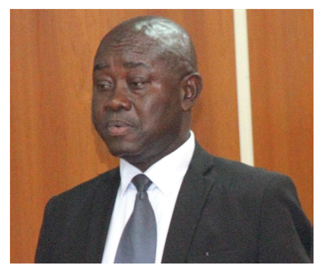
Hon. Justice Keikura Bangura