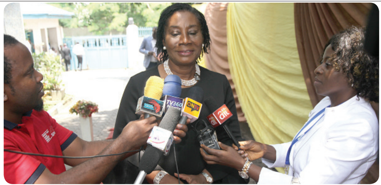
Hon. Justice Dupe Atoki being interviewed by the press