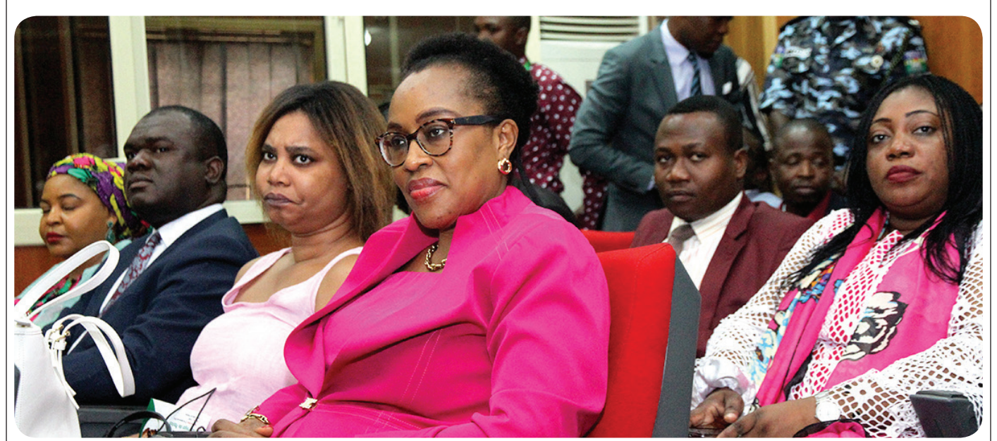
Guests and Staff of the Court listening attentively at the ceremony