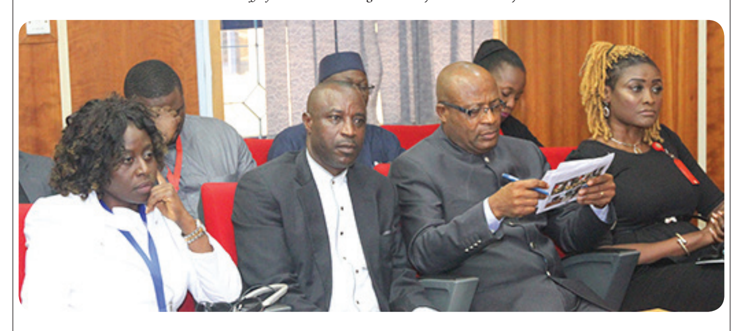
Some members of the press, guests and staff